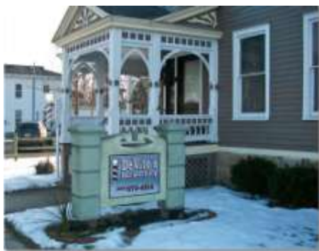
DeVito's Barber Shop 117 East Miller St., Newark

DeVito's has retail space available with lots of parking.